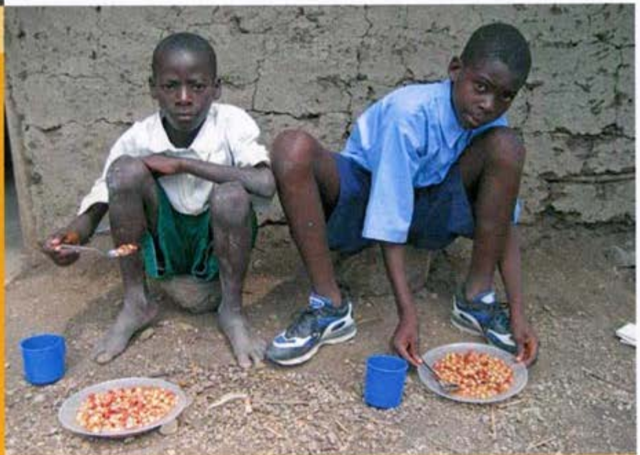
Boys at Kaswanga, thankful for their meal.